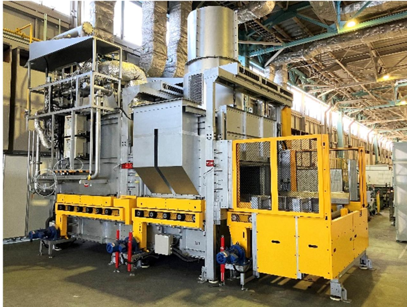
Demonstration test furnace for ammonia combustion