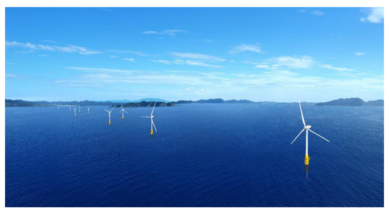
Rendering of project upon completion