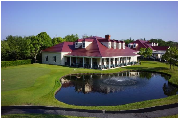
Taiheiyo Club Arima Course