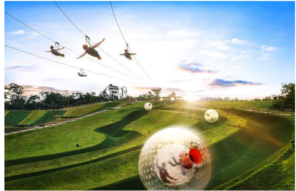
Nesta Resort Kobe

Click here for details on other stores and facilities accepting the vouchers.