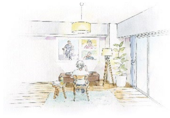
Living space where residents can enjoy exercise while maintaining remote communication with friends

In celebration of the first anniversary of “MYRENO OSAKA,” which opened in October last year, special seminars and workshops on renovation will be held from October 9 (Monday) to 15 (Sunday), excluding October 11 (Wednesday). Anticipating the era of a 100-year life, seminars on “Key points of renovation for people over 50” will also be held. The program is designed to be enjoyable for a broad range of audiences, from those new to renovation to those with a strong interest in the topic.