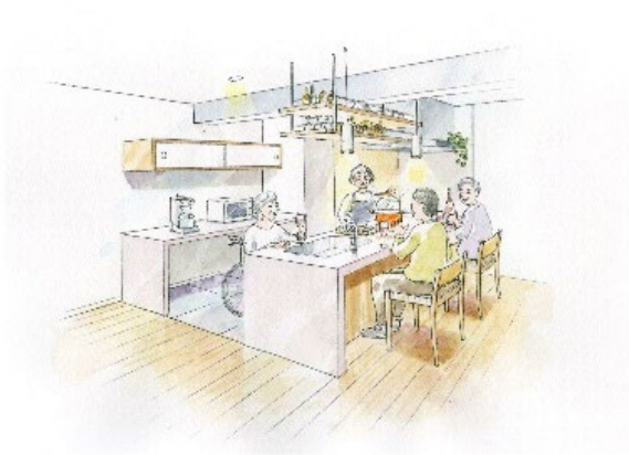
Kitchen where wheelchair users can enjoy cooking