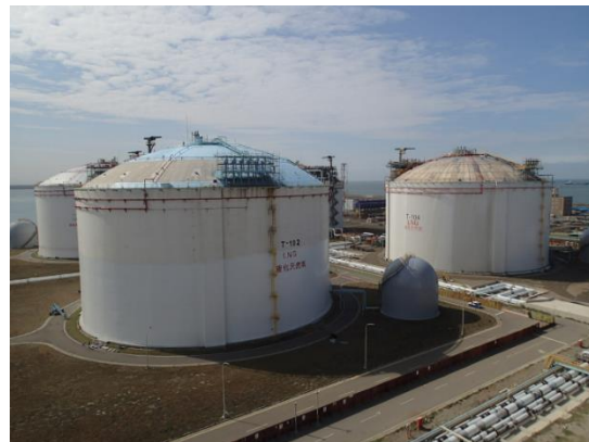
LNG Tanks in CPC Taichung LNG Receiving Terminal (Phase-2)

LNG Receiving Terminals in Taiwan (including those under planning/construction)