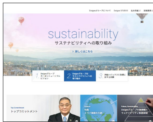
The Daigas Group Sustainability website

The Integrated Report is available on the Group's Investor Relations website (IR website https://www.osakagas.co.jp/en/ir/ ). The IR website and the Sustainability website provide the update on financial and non-financial information as well as timely topics.