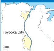
Service Area: Toyooka City, Hyogo Prefecture