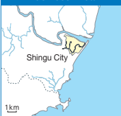
Service Area: Shingu City, Wakayama Prefecture