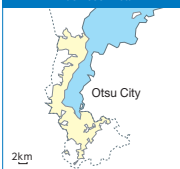
Service Area: Otsu City, Shiga Prefecture