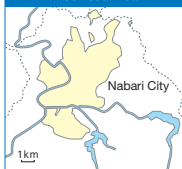
Service Area: Nabari City, Mie Prefecture