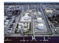
Senboku Plant at start of operations (Osaka Prefecture)