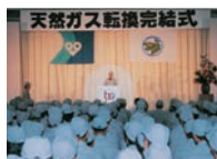
Natural gas conversion completion ceremony