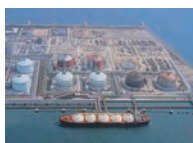
Himeji LNG Terminal at start of operations (Hyogo Prefecture)