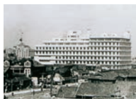
Osaka Gas Building