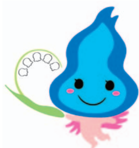
Homuten Osaka Gas Group "Small Light Campaign" character Registration No. 5837064