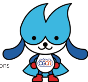
Mamorinu Osaka Gas Customer Relations official character Registration No. 5808421