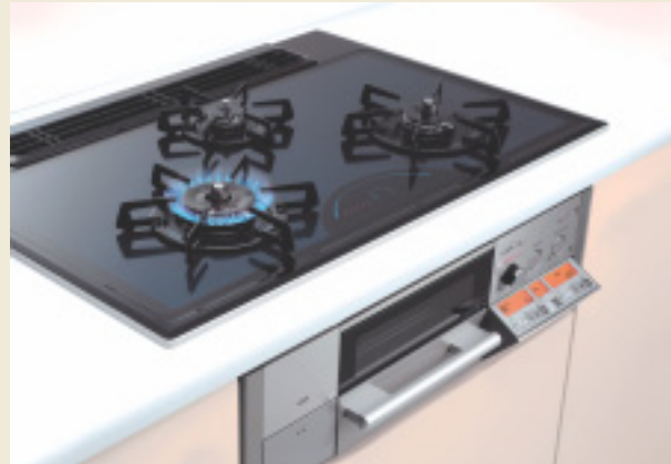
Class-S Premier offers the convenience of an advanced glass-top stove.

We have invested our resources strategically in technology development, deeming it to be the most effective method of differentiating ourselves in the market and bolstering our technological competitiveness. The need for technology management that can produce early outcomes from technology development programs to use in business is rising amid the constant change in demand among customers and the dramatic changes in business climate. We intend to implement thorough technology management to satisfy the demands of the market.