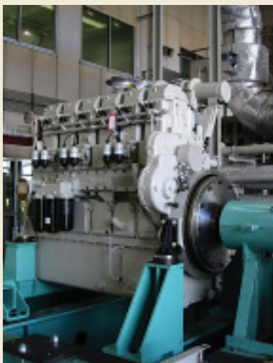
Long-stroke Miller-cycle engines

As the demand for economically efficient and eco-friendly cogeneration systems steadily rises, we are developing our technology to improve electricity generation efficiency and overall energy efficiency. Other actions include extending our product lineup to offer a range of electricity generation capacities. In April 2005, we successfully developed a highly efficient gas cogeneration system that achieved 41.5% (LHV standard) power generation efficiency, the world's highest in the 300-kilowatt generation capacity class. We also enhanced the efficiency of long-stroke Miller-cycle gas engines—which have longer piston strokes than traditional Miller-cycle gas engines—by improving combustion efficiency and reducing heat loss.