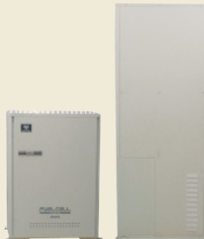
PEFC cogeneration system for household use

Since our 1982 launch of KAWACK, we have achieved substantial penetration of the bathroom heating and drying equipment market with this product. In 2004, in response to the recent heightened demand for health and beauty products, we launched the new MIST KAWACK, which incorporates a mist generator. Enabling people to enjoy a sauna in the comfort of their home, the product has been well received in the market. To promote use of this technology by even more customers, we expanded our lineup in April 2006, adding MIST PLUS, a mist generator that can be easily attached to an existing KAWACK model. For the ultimate in comfort, we also launched Micromist Sauna, a mist generator that emits nano-water