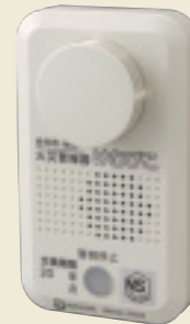
KEMU PIKO, a fire warning system for residential use