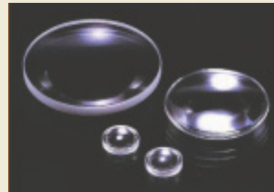
Fluorene conductors are used in lenses for mobile phones incorporating cameras.