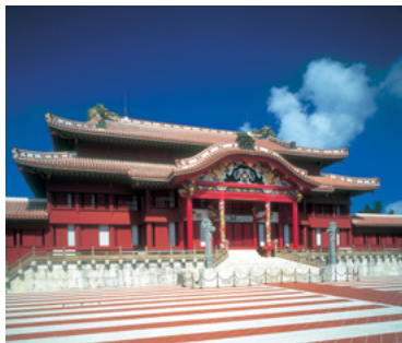
Shuri Castle in Okinawa Prefecture using high-performance wood protective coating from Japan EnviroChemicals

In April 2005, the Group acquired shares of its subsidiaries and affiliate companies, including Japan EnviroChemicals, Ltd., one of the leading manufacturers dealing in the activated carbon business and the preservative business including wood protective coating materials. In the same month, it also merged Osaka Gas Chemicals, Taiyo Kasei, and Donnac to further enhance the liaison between processes from production to sales. Hereafter, the Group aims at expanding the carbon material business including activated carbon by bringing together the technological ability and know-how owned by Osaka Gas Chemicals and Japan EnviroChemicals and focuses on the growing businesses including electrode materials and fine materials to extend the scale of the operation.