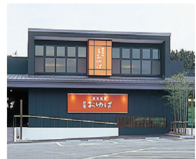
Health Spa Banpaku Oyuba <OUD Co., Ltd.>