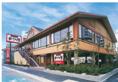
Kagono-ya < Kinrei Co., Ltd.>