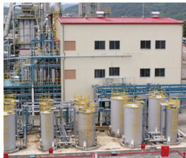
A plant of Full Fine Co., Ltd located in Okayama Prefecture began operations in August 2003