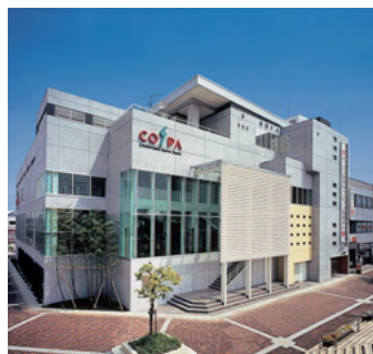
COSPA Goido fitness facility in Kashiba City, Nara Prefecture, directly operated by OG Sports

While advancing selection and concentration of various group operations, the OG Capital Group aims to expand earnings by investing management resources in businesses with growth potential, such as athletic and security businesses.